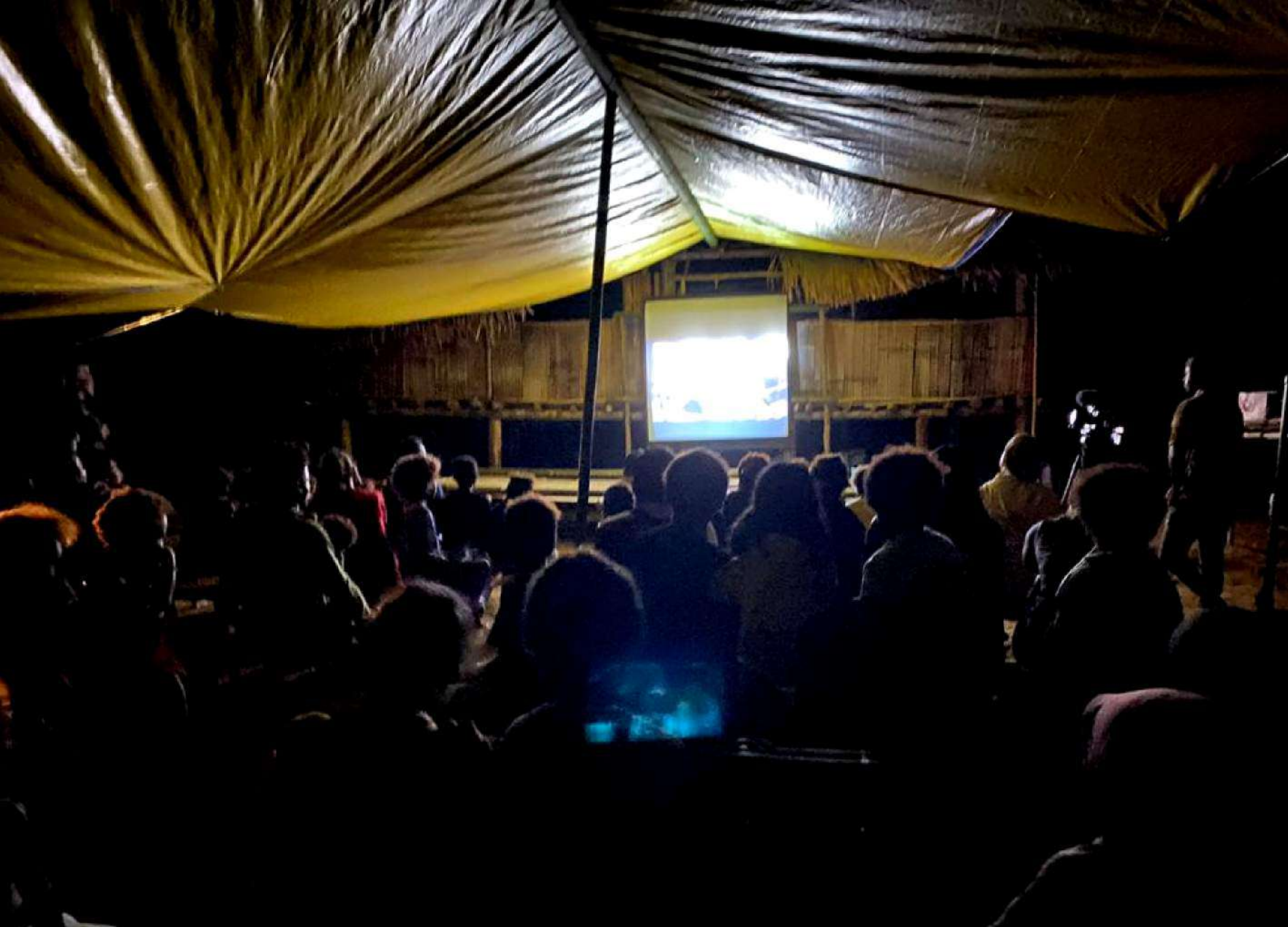
The day ended with a film screening of various documentaries on tigers and the environment.