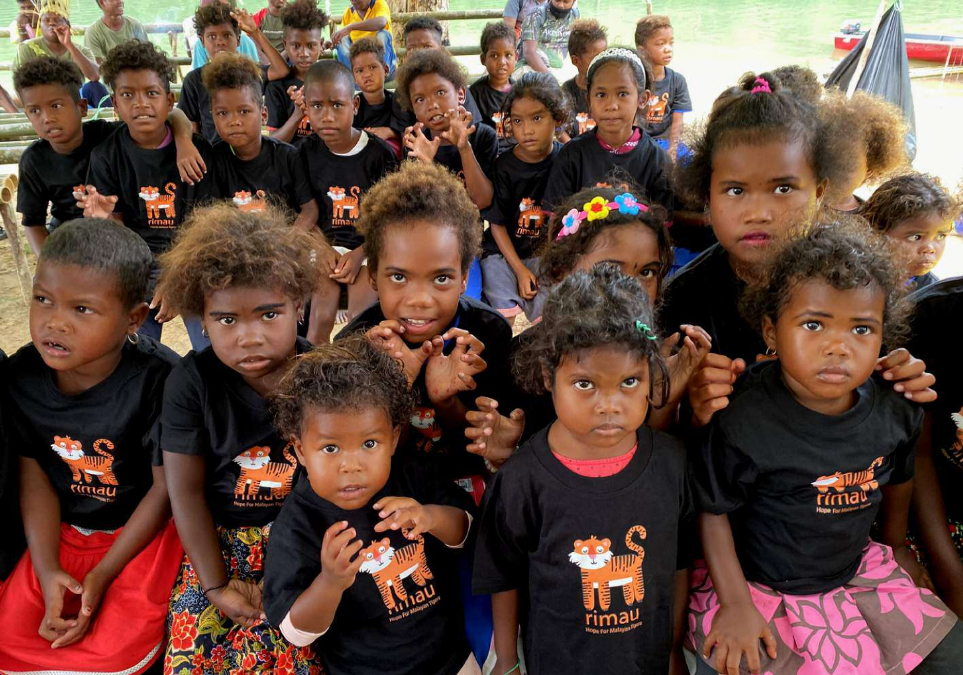
All the children in the village received a limited edition RIMAU t-shirt.