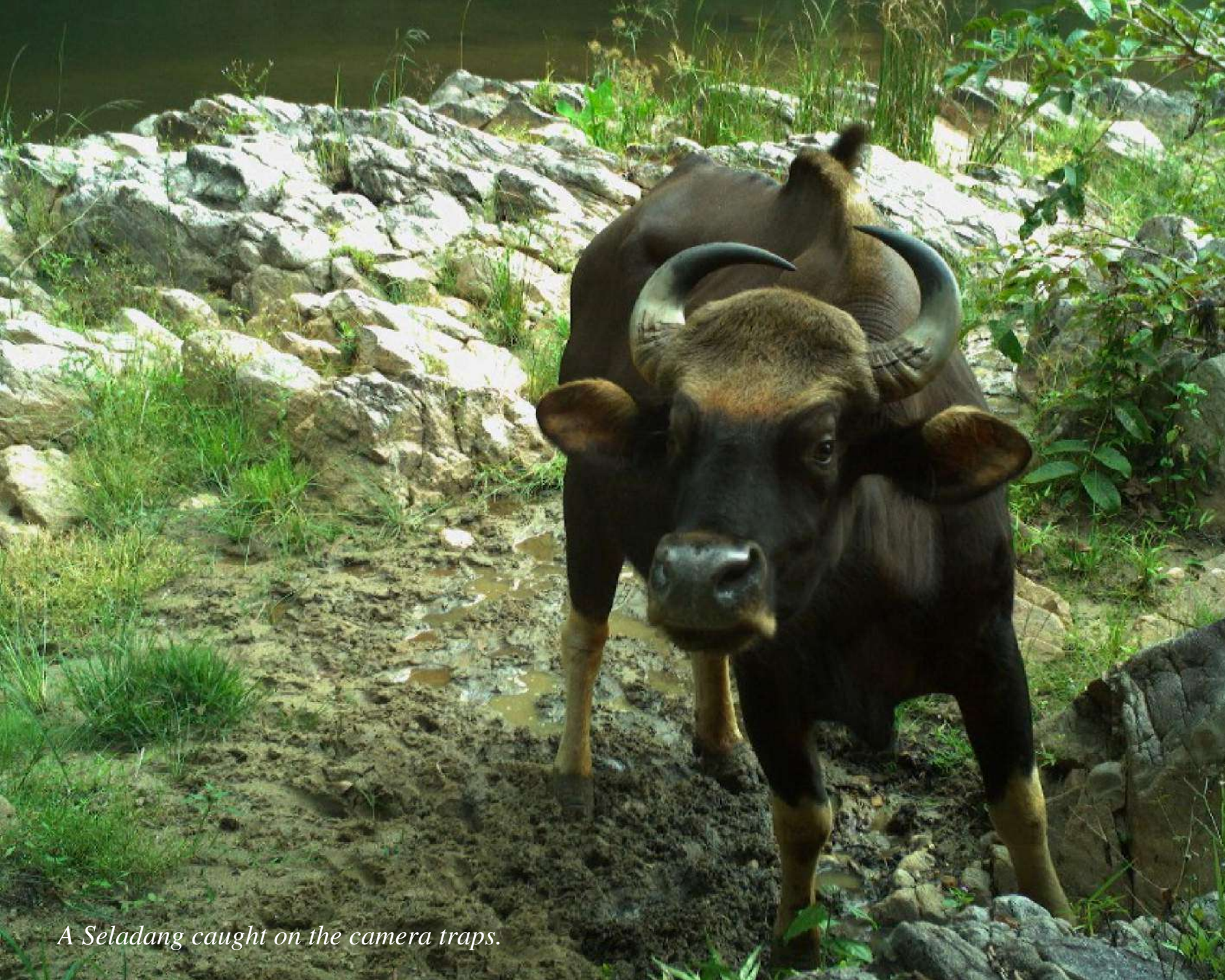
A Seladang caught on the camera traps.